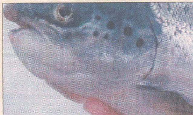
Examples of deformities: Fusion of vertebrae in juvenile cod (top), where bones have been stained with Alizarine Red to display the bone structure; and malformed jaws in Atlantic salmon